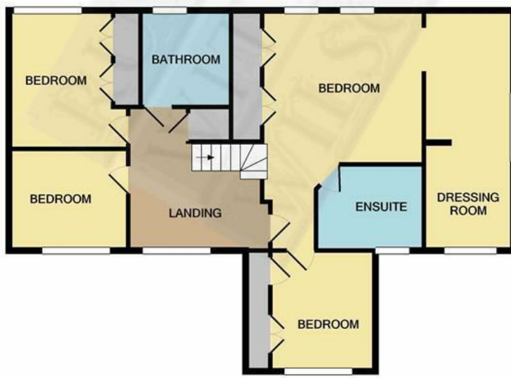
1ST FLOOR APPROX. FLOOR AREA 706 SQ.FT. (65.6 SQ.M.)

TOTAL APPROX. FLOOR AREA 1488 SQ.FT. (138.2 SQ.M.)