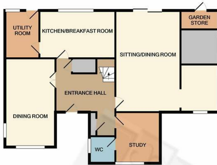
GROUND FLOOR APPROX. FLOOR AREA 782 SQ.FT. (72.6 SQ.M.)